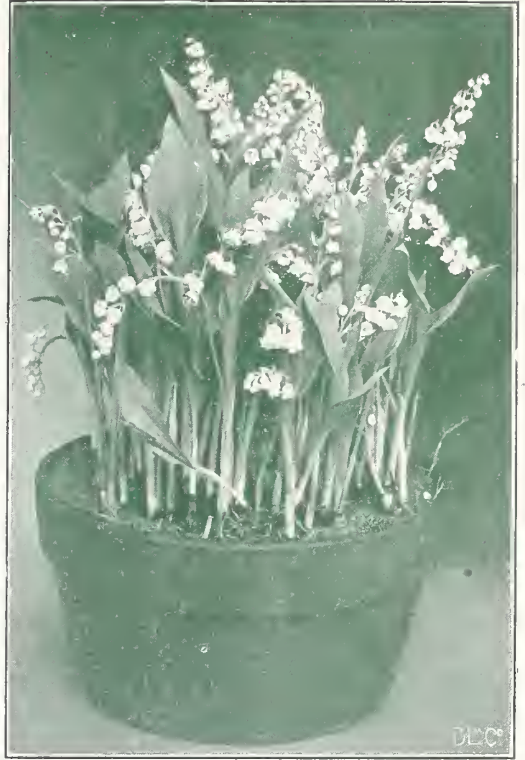
LILY OF THE VALLEY

This has been one of our specialties for over twenty years. This year we are growing over 125,000 plants. Craig Cyclamen are now considered best. We are now booking orders for strong plants from 2¼-inch pots.....$8 per 100; $75 per 1,000 4-inch pots.....$25 per 100; $225 per 1,000 May delivery.